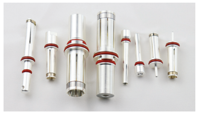
Electric Vehicle Charger Pins