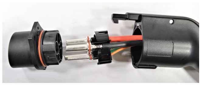
Electric Vehicle Charger Assembly

The information set forth herein is furnished free of charge and based on technical data that Chemours believes to be reliable. It is intended for use by persons having technical skill, at their own discretion and risk. The handling precaution information contained herein is given with the understanding that those using it will satisfy themselves that their particular conditions of use present no health or safety hazards. Because conditions of product use are outside our control, Chemours makes no warranties, express or implied, and assumes no liability in connection with any use of this information. As with any material, evaluation of any compound under end-use conditions prior to specification is essential. Nothing herein is to be taken as a license to operate under or a recommendation to infringe any patents.