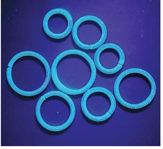
Round Springs with UV Trace \mathsf{Krytox}^* Oil