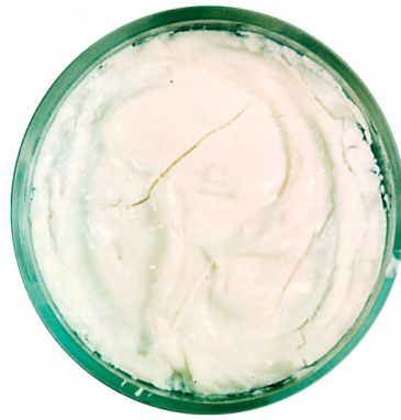
PFPE (Krytox™ GPL 227)

In an oven at 232 °C (448 °F) for 40 hours, hydrocarbon (left) lost 40% of weight and developed tar and significant hardening. PFPE (right) remained unchanged, retaining all lubrication properties, and still meeting new product specifications.